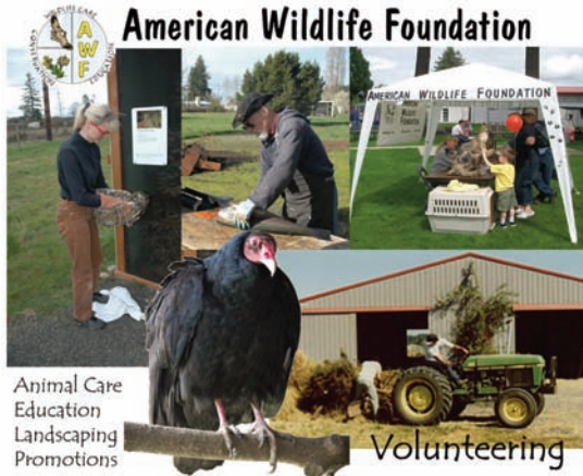
Animal Care Education Landscaping Promotions